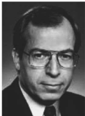
George M.C. Fisher Retired Chairman of the Board and Chief Executive Officer, Eastman Kodak Company Director since 2000 Age 64

The following four directors' terms will expire at this year's annual meeting. Each of these directors has been nominated and is standing for election to serve another term that will expire in 2008. See page 28 of this proxy statement for more information.