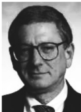
Alfred G. Gilman, M.D., Ph.D. Regental Professor and Chairman, Department of Pharmacology, The University of Texas Southwestern Medical Center Interim Dean, Southwestern Medical School Director since 1995 Age 63

Mr. Fisher served as chairman of the board of Eastman Kodak Company from 1993 to December 2000. He also served as chief executive officer from 1993 to January 2000 and as president from 1993 until 1996. Prior to joining Kodak, he was an executive officer of Motorola, Inc., serving as chairman and chief executive officer from 1990 to October 1993, and president and chief executive officer from 1988 to 1990. Mr. Fisher is chairman of PanAmSat Corporation, a senior advisor for Kohlberg Kravis Roberts & Company, and a director of General Motors Corporation. He is a member of The Business Council and was chairman of the National Academy of Engineering from 2000 to 2004.