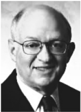
Martin S. Feldstein, D.Phil. President and Chief Executive Officer, National Bureau of Economic Research, and George F. Baker Professor of Economics, Harvard University Director since 2002 Age 65

The following four directors will continue in office until 2006.